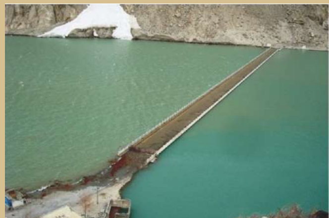
Submerged Shishkat-Gulmit Bridge