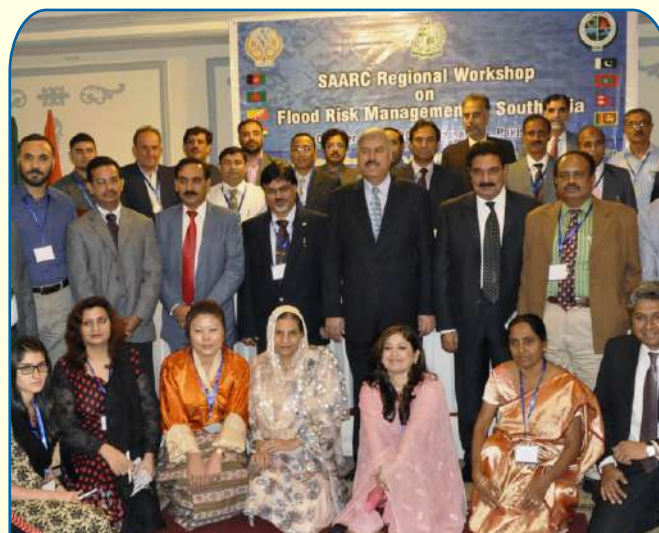
A Group photo of the participants of “SAARC Workshop on Flood Risk Management in South Asia” with the chief guest Rana M. Farooq Saeed Khan, Federal Minister for Climate Change.

Rana Muhammad Farooq Saeed Khan, the Federal Minister for Climate Change opening ceremony as the Chief Guest. He said that South Asian countries are facing the flooding problem because of the climate change and occurrence of floods has been seen increasing both in frequency and magnitude over the years. He stressed on the collaborative effort from the SDMC for a more rigorous approach toward disaster management at regional level.