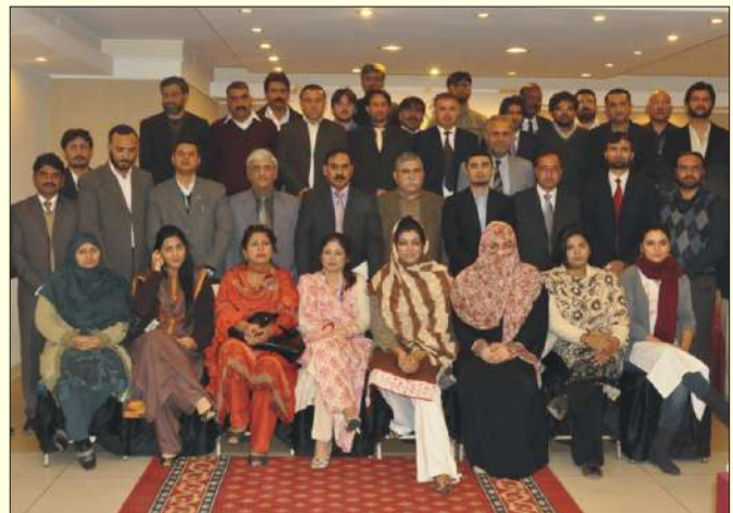
A Group Photo of Chairman NDMA with Participants of "Workshop on Mainstreaming DRM in Agriculture and Food Security" Jointly organized by NDMA and FAO

The main objective of the workshop was to reach a common understanding on the scope of Disaster Risk Management (DRM) and its role in the context of agriculture and food & nutrition security management, and to identify key opportunities and bottlenecks while framing a set of recommendations and action plans for mainstreaming DRM in Federal and Provincial institutions and policy.